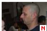
Not forward facing